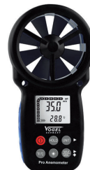
ART N° 641205