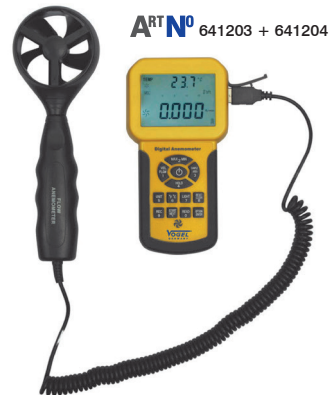
ART N° 641203 + 641204